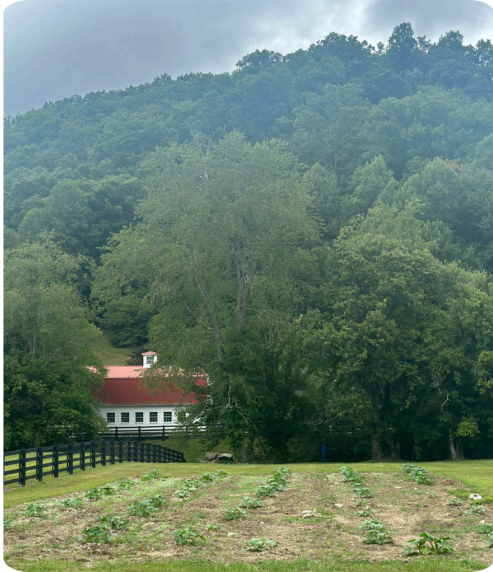
Late Summer blooming in the Pumpkin Patch.