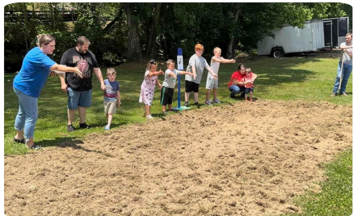
Local youth spreading the first seeds on the 4-H Monarch Waystation.

Monarch butterflies play a crucial role in pollination, supporting biodiversity and contributing to the health of ecosystems worldwide. However, the loss of milkweeds and nectar sources has threatened their populations. In Martin County, the 4-H program was the first to create a Monarch Waystation, and we're excited to see others joining the cause. Monarch Waystations offer essential nectar and shelter for butterflies, helping to offset habitat loss. By creating or conserving these habitats in home gardens, schools, businesses, parks, roadsides, and other unused spaces, we can help support monarchs during their migration. Even simple efforts, like adding milkweeds or maintaining natural habitats, can make a significant difference. These actions have local benefits, enhancing local biodiversity, but they also have a global impact of supporting the pollination needs of agriculture, which is crucial for food production worldwide. Every effort, no matter how small, helps protect these incredible insects and their vital role in our ecosystems. Learn how to create your own by contacting the 4-H team.