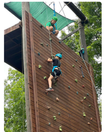
Campers participating in Archery and High Wall Challenge Course.